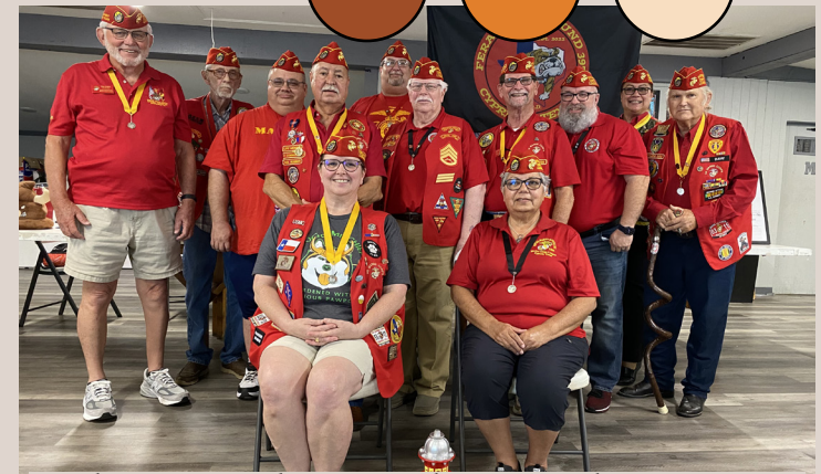
Feral Dogs Pound 397 Growl, Texas Pack, August 2024