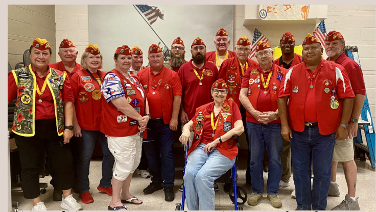
Top of Texas Dogs Pound 268, Texas Pack, July 2024