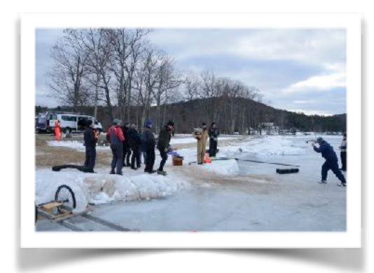
DN Racing - 2020 New England Championships Lake Winnipesaukee NH