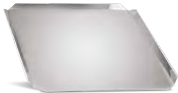
14" x 17" COOKIE SHEET Beautiful, large, heavy-duty stainless steel cookie sheet. MI-143