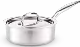
2 QT SAUCE PAN W/ COVER Beautiful 2-quart, 7-ply stainless steel saucepans provide exceptional performance. HSC-14302