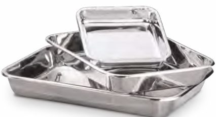
3 PC RECTANGULAR BAKE PAN SET Set includes 8"x 8" square bake pan, 11"x 16" bake pan and 12"x 18" bake pan. Heavy-duty stainless steel bakeware set. MI-138A