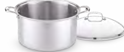
12 QT DUTCH OVEN W/ COVER 12-quart, multi-clad stainless steel stock pot/Dutch oven. HSC-14312