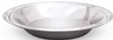
2 PC 9" PIE PLATE 9" heavy-duty stainless steel pie plate. This set includes two pie plates. MI-171