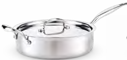
4 QT DEEP SAUTÉ PAN W/ COVER 4-quart, 7-ply surgical stainless steel deep sauté. A must in every home. Sauté has a long handle and side handle. HSC-14311