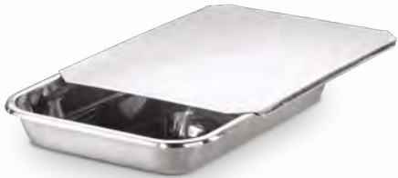
9" x 13" COVERED BAKE PAN Beautiful stainless steel cake pan with stainless steel cover. MI-138C