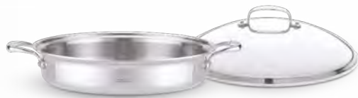
13½" BUFFET CASSEROLE W/ COVER Extra wide 13.5" multi-clad stainless casserole. Stainless steel cover included. HSC-14340