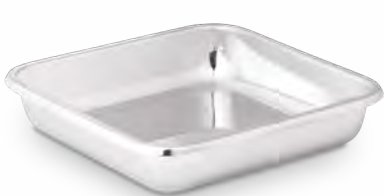
8"x 8" SQUARE BAKE PAN The perfect brownie pan. MI-138B

Our bakeware is professional grade and manufactured to specifications. Made in India.