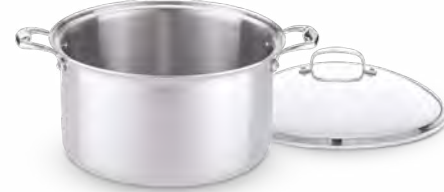
16 QT STOCK POT W/ COVER 16-quart, multi-clad stainless steel stock pot/Dutch oven. HSC-14316