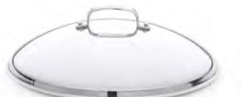
13½" STAINLESS STEEL COVER 13.5" wok-style stainless steel cover that fits on the 13.5" sauté, 13.5" fry, 12- and 16-quart stock pots. HSC-14926