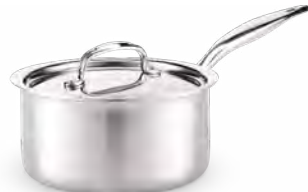
2¾ QT SAUCE PAN W/ COVER Beautiful 2.75-quart, 7-ply stainless steel saucepans provide exceptional performance. HSC-14303