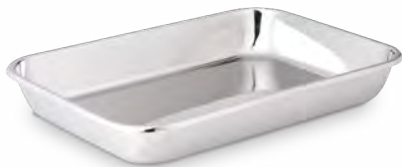
11" x 16" BAKE PAN Heavy-duty, stainless steel rectangular bake pan designed to last a lifetime. MI-138E