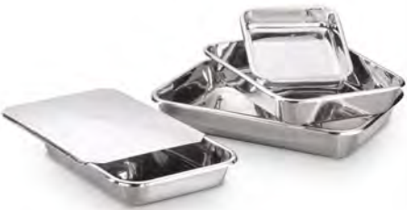
5 PC RECTANGULAR BAKE PAN SET Set includes 8"x 8" square bake pan, 9"x 13" covered cake pan, 11"x 16" bake pan and 12"x 18" bake pan. Heavy-duty stainless steel bakeware set. MI-138