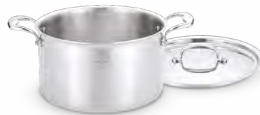
8 QT DUTCH OVEN W/ COVER 8-quart, 7-ply surgical stainless steel stock pot/Dutch oven. HSC-14308