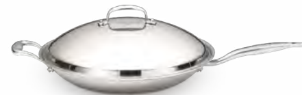
13½" JUMBO FRY PAN W/ COVER Large professional-grade multi-clad stainless steel fry pan w/ 13.5" wok style stainless steel cover. HSC-14925