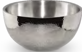
4 QT HAMMERED SALAD BOWL 4-quart, double-walled, insulated, hand-hammered stainless steel bowl. MI-146