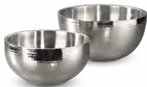
2 PC HAMMERED BOWL SET Polished 1-quart and 2-quart double-walled, insulated stainless steel bowls. MI-145