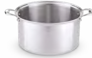
12 QT DUTCH OVEN 12-quart, multi-clad stainless steel stock pot/Dutch oven. HSC-14335