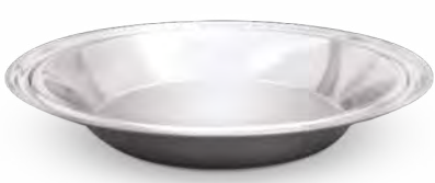
9" PIE PLATE 9" heavy-duty stainless steel pie plate. MI-141