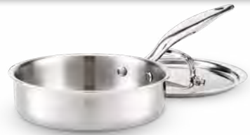
1½ QT SAUCE PAN W/ COVER Beautiful 1.5-quart, 7-ply stainless steel saucepans provide exceptional performance. HSC-14301