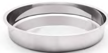
2 PC 9" ROUND CAKE PAN 9" heavy-duty stainless steel cake pan. This set includes two cake pans. MI-172