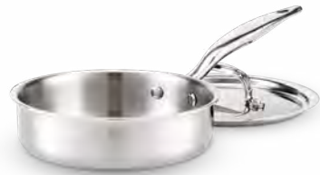
1½ QT SAUCE PAN W/ COVER (CASE OF 6) Beautiful 1.5-quart, 7-ply stainless steel saucepans provide exceptional performance. HSC-14301C