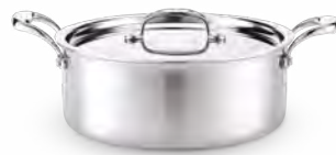
6 QT DUTCH OVEN W/ COVER 6-quart, 7-ply surgical stainless steel stock pot/Dutch oven. HSC-14306