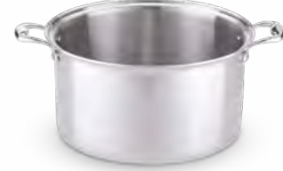
16 QT STOCK POT 16-quart, multi-clad stainless steel stock pot/Dutch oven. HSC-14317