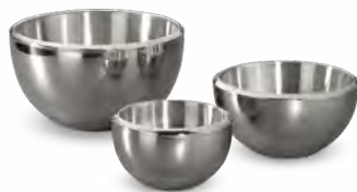
3 PC MILANO BOWL SET This set includes a .75-, 1.5- and 3-quart capacity double-walled, insulated, stainless steel bowls. MI-156