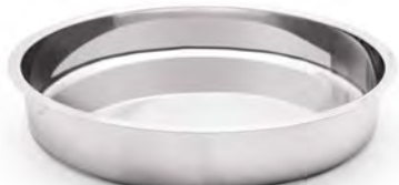
9" ROUND CAKE PAN 9" heavy-duty stainless steel cake pan. MI-142