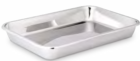
12" x 18" BAKE PAN Heavy-duty, stainless steel rectangular bake pan designed to last a lifetime. MI-138D