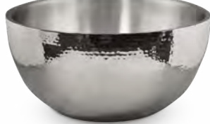
6 QT HAMMERED BOWL Large 6-quart, double-walled, insulated, hand-hammered, stainless steel bowl. MI-147