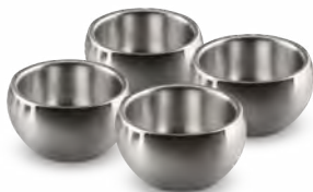
4 PC SOPHIA BOWLS Beautiful, polished, stainless steel, double-walled, insulated bowls. Small set is perfect for dips, nuts, and decorating. MI-144