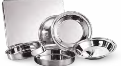
5 PC CLASSIC BAKE SET Durable heavy-duty stainless steel. The set includes: 2-9" round cake pans, 2-9" pie plates and 1-14"x 17" cookie sheet. MI-150