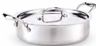
4 QT SAUTÉ CASSEROLE PAN W/ COVER 4-quart, 7-ply surgical stainless steel deep sauté. A must in every home. HSC-14304

Cook with confidence with Hammer Stahl cookware. The unique multi-clad steel transfers heat evenly and efficiently while the surgical-grade stainless cooking surface is durable, easy to clean and virtually nonporous. The cookware line features stay-cool hollow handles, is dishwasher safe, induction ready and has a lifetime warranty. Proudly crafted with American steel in Clarksville, TN.