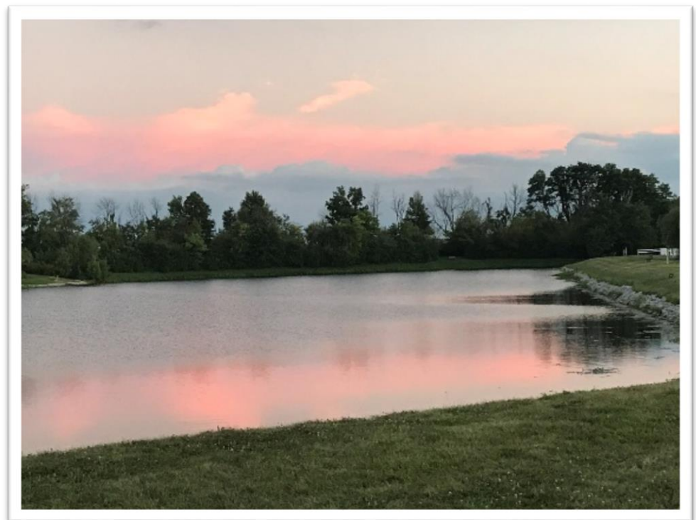
Sunset view of Redbud Lake