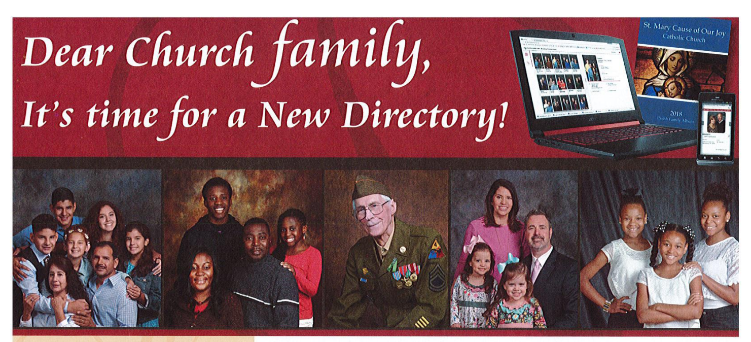
Celebrating faith. Connecting families. Sharing hope.

When people enter the doors of our church they are looking for a place to belong. Our directory brings us together to develop new relationships, connect with our own families, and reconnect with those we haven't seen in a while. Join us for this "Connections Event" and be part of what God is doing right here at our church!