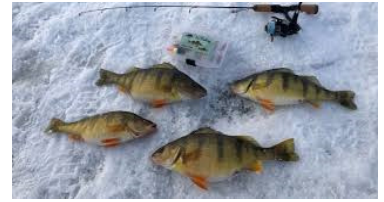
Cascade Cup Feb. 2024