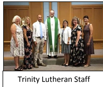
Trinity Lutheran Staff