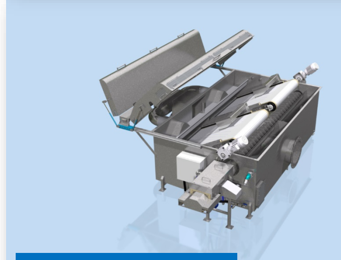
Figure 3. ES-3600 Stand-alone unit

The Mitcherson EcoSieve Models ES-270, ES-940, ES-1800 and ES-3400 are single belt machines. The ES-3600 is a duplex arrangement with 2 belt assemblies installed in one housing with one solids collection system. The EcoSieve can be provided on a pre-wired skid mounted platform which can drastically reduce field installation cost. Our skid units can be mobile stand-alone units ready for deployment.