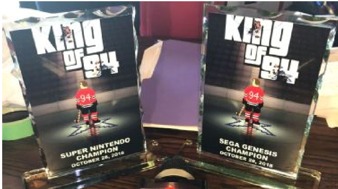
The winners of the Sega Genesis and Super Nintendo tournaments took home a $1,000 prize, one of these trophies and bragging rights for the next 12 months.

"It was an incredibly entertaining day of NHL 94 action. And we will see you next year, on the 25th anniversary of the game, for King of 94 IV!"