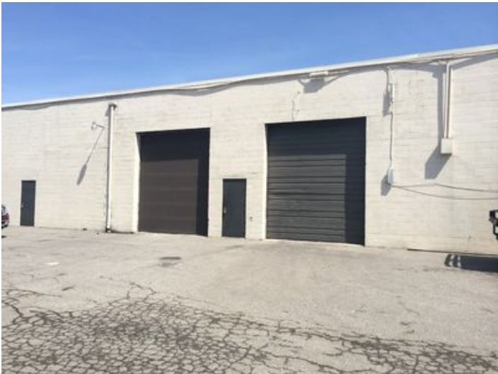
26469 Northline (11)