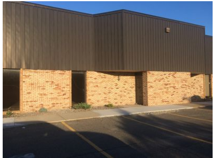
taylor trade center 2