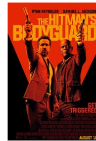
THE HITMAN'S BODYGUARD 8/22