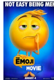
THE EMOJI MOVIE 8/8

Don't miss the next Sensory Friendly Film!