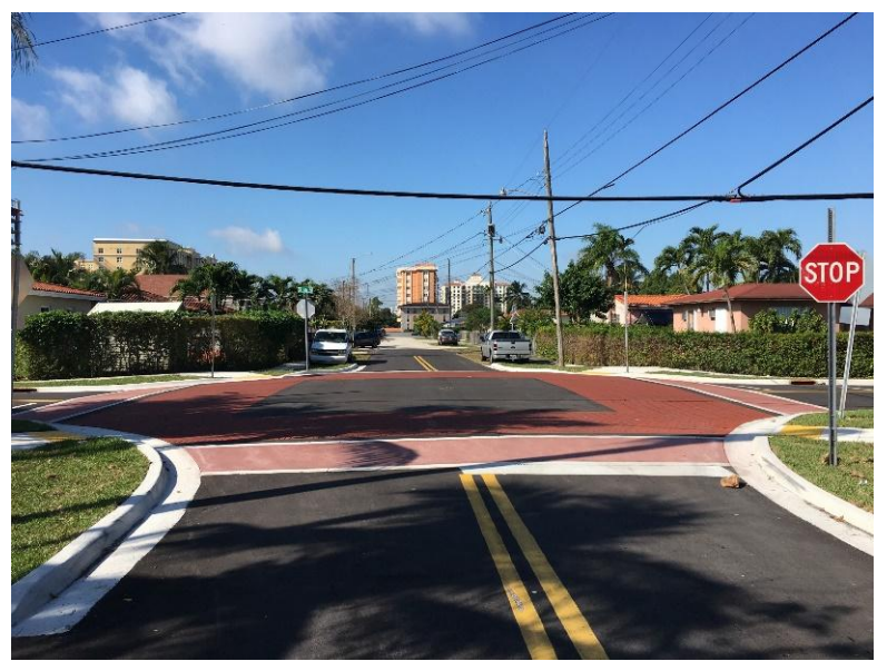
Raised Intersection with Textured Pavement (SW 36<sup>th</sup> Avenue at SW 14<sup>th</sup> Street)