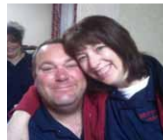
And a note to Tony T. - please pick up your camera again!!