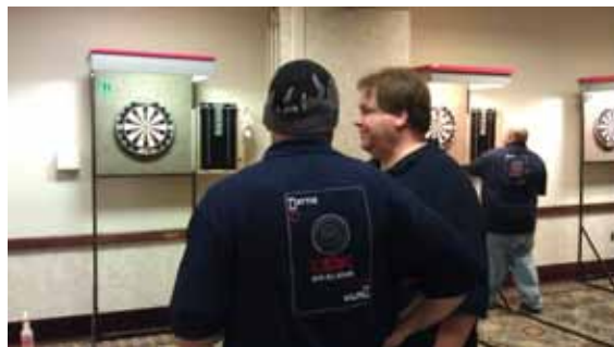
Held in late November at the Ramada Plaza on Morse Road in Columbus, the Quad City Challenge follows the Buckeye Open tournament. Cincinnati, Columbus, Cleveland and Dayton compete in the annual event.