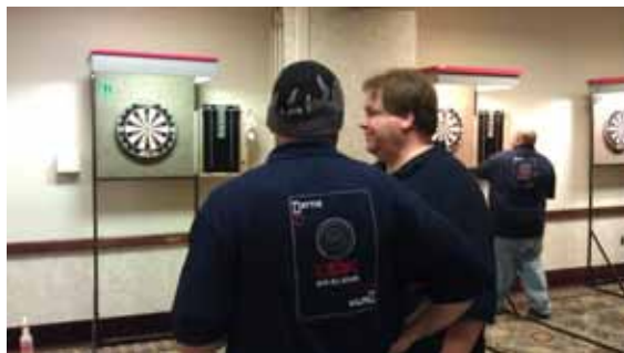
Held in late November at the Ramada Plaza on Morse Road in Columbus, the Quad City Challenge follows the Buckeye Open tournament. Cincinnati, Columbus, Cleveland and Dayton compete in the annual event.