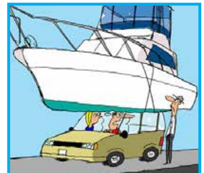
"We don't have a trailer hitch yet, so how else were we supposed to take the boat out?"

Whether you are new to the neighborhood, have a house in the community or haven't visited your property in years, get the latest information. Send your email address to CBTBay@gmail.com to be added to the email distribution list. Join in the conversation on our closed Facebook group. Send the email address your Facebook account is under to CBTBay@gmail.com to be added to the group.