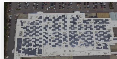
992kW South Carolina