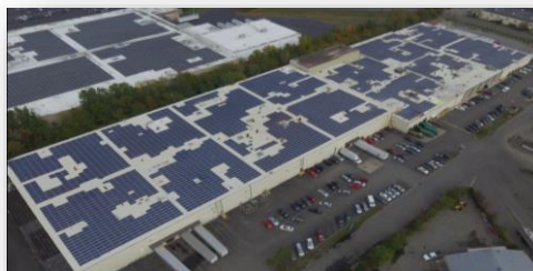
1.45mW Totowa, NJ