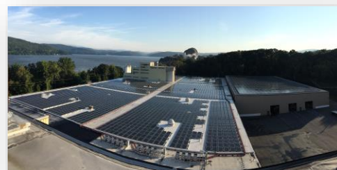
2.4MW Buchanan, NY