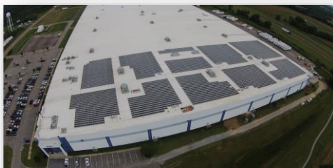
1.0mW Byhalia, MS