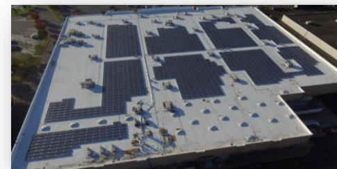
604kW Ocean Township, NJ