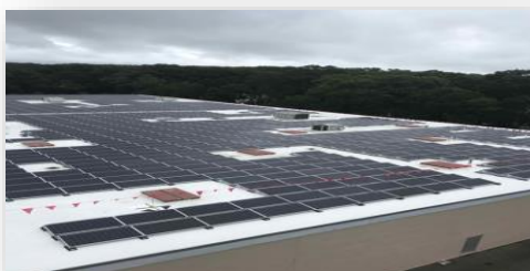
857kW Central Islip, NY