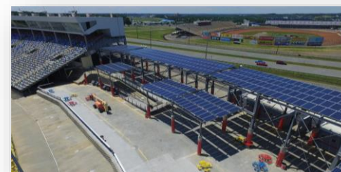
301kW Charlotte, NC