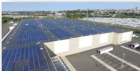
1.42mW Jersey City, NJ