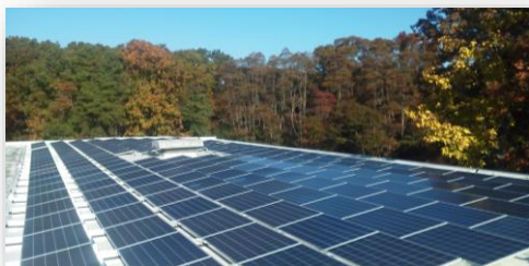
1.0mW Hamilton, NJ