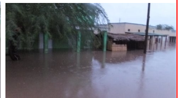
These four pictures above from Mary Dawrant showing downtown Bangula completely underwater.....