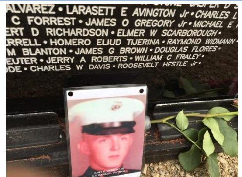
James Otto Gregory Jr. Killed July 4th 1966 Danang Vietnam

The City of Conover was proud to host the Vietnam Veterans Memorial traveling wall from September 8, 2017 through September 11, 2017 at Conover Station.