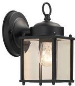
Portfolio 8-1/4-in Black Outdoor Wall Light Item #: 338648 | Model #: FY05-030