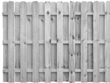
Example of shadow box design: