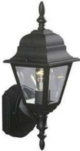
Galaxy 15-3/8-in Black Outdoor Wall Light Item #: 432335 | Model #: 301021BK