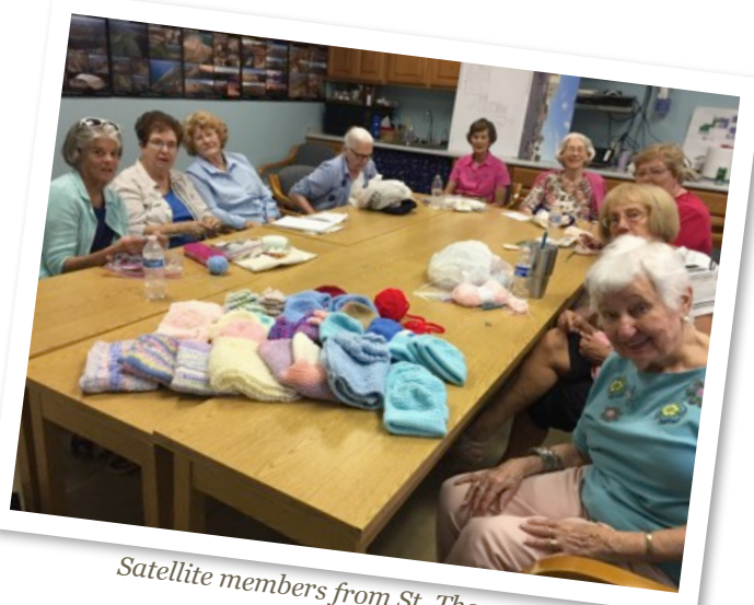
Satellite members from St. Thomas

Meet more satellites in our next newsletter!