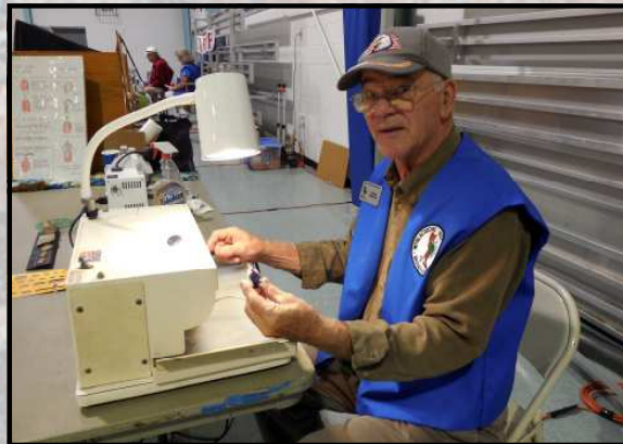
Demonstrating rock grinding and polishing.