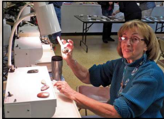
Grinding and polishing rocks to make jewelry.