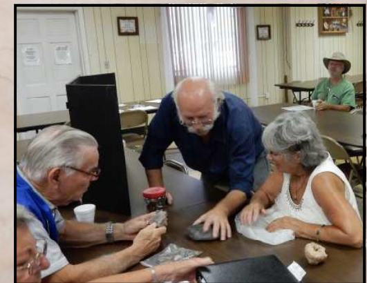
Discussing show-and-tell items.