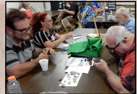
Identifying rocks, minerals, and fossils.