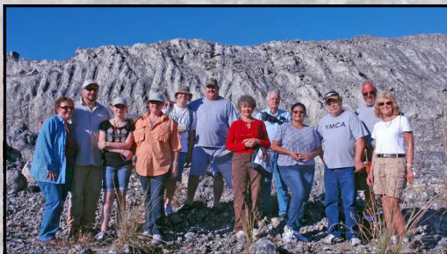
Club members at the Vulcan Mine.