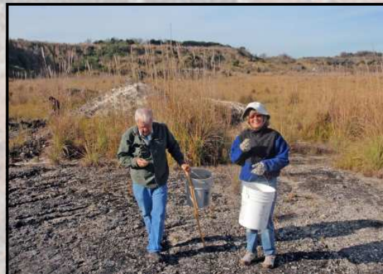
Looking for rock, mineral, and fossil treasures.