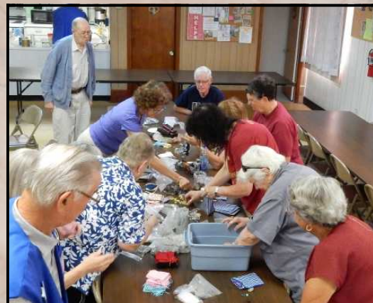
A wire-wrapping class.