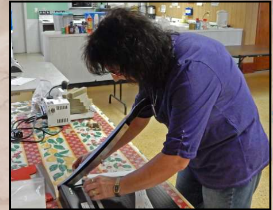
Working on club projects.