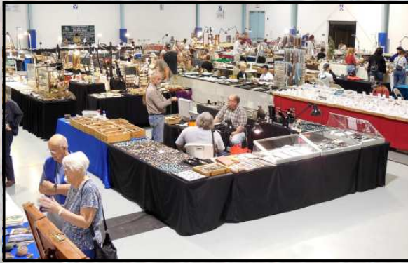
Our annual gem show in Hudson, FL