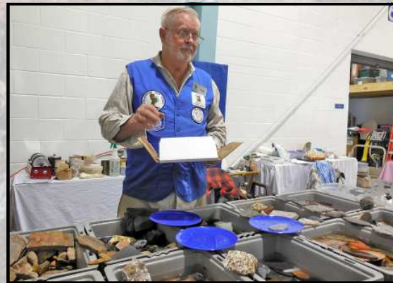
Rocks, jewelry, and lapidary tools.

Withlacoochee Rockhounds is a non-profit organization with the purpose of fostering interest and promoting knowledge of minerals, gems, fossils, and the earth sciences.