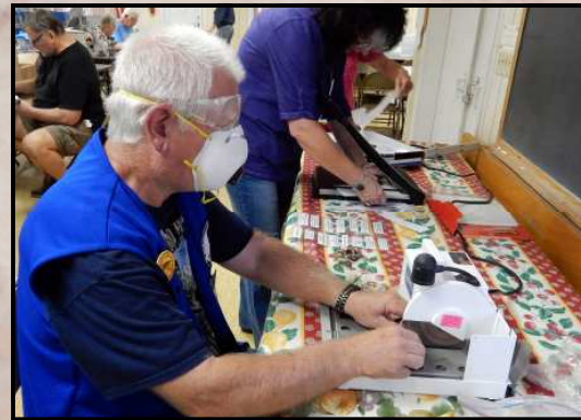
Cutting slabs with the rock saw.