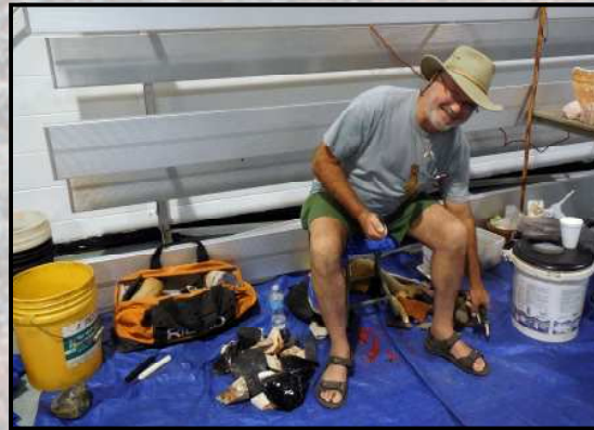
Knapping demonstration at the gem show.