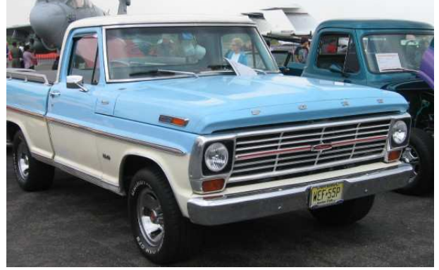
Guess who - Wings and Wheels Show