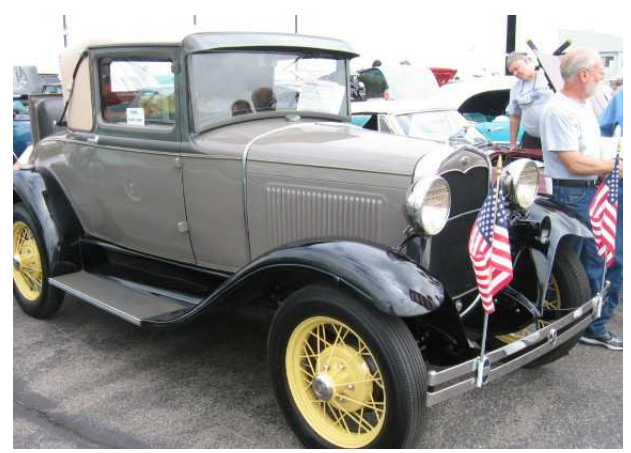
Nice 31 Model A

Monday Rochelle Park 375 West Passiac St (Mr Cupcakes) 1st Monday of the month Saddlebrook-427 Market St. (Advance Auto) Tuesday Mahwah-Ramapo Valley Rd (RT 202)Creamery Snack Bar Wayne-Wendy's-Rte 23 North Carlsadt-645 Washington (The Grasshopper) Clifton, Ruts Hut North Bergen-2849 Kennedy Rd. (Sonic Drive IN) Wednesday Wycoff-Greenwood Ave Englewood-412 South Van Brunt St (4 West Diner) Wayne - Rte 23 West (Wendy's) Thursday E. Rutherford-Cheeburger/Cheeburger Rte 17 SO Emerson-Emerson Shopping Center, Kinderkermack Rd. Hackettstown-Mountain Ave (Lowes and Wendy's Shopping Ctr. Wavne- Rte 23 West (Kohl's) Friday Midland Park Greenwood Ave (Hot Dog Caboose) Elmwood Park-Legion Place (Am. Legion Post 147) Boonton-Wooten St. (Wal-Mart shopping Ctr) Saturday Lyndhurst-1050 Wall St. (Whiskey Cafe) Local Show Pics