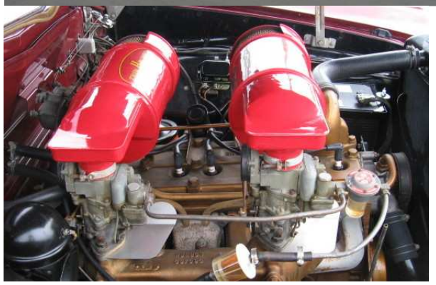
"Twin H" Hudson