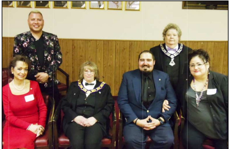
Class named in Honor of 2022-2023 Officers

Join us at the Westminster Elks 2227 for a fun day on April 23rd at 2 pm. Come to "Sip and Paint". $40 includes all supplies, a glass of wine or a draft beer AND DINNER!!