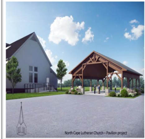
North Cape Lutheran Church - Pavilion project