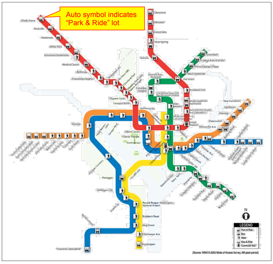
Figure 19. Predominant Access Modes by Station in 2002

This capacity study included the figure below, and stated: "Figure 19 shows the predominant access mode at each existing station, based on the 2002 On-Board Metrorail Passenger Survey data." ( Reference 5 , pages 37-38). Note that the predominant access for suburban stations is auto parking ("park & ride").