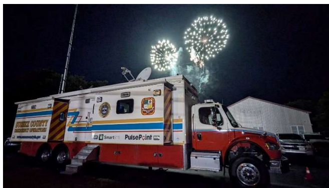
Millsboro Fireworks 2024