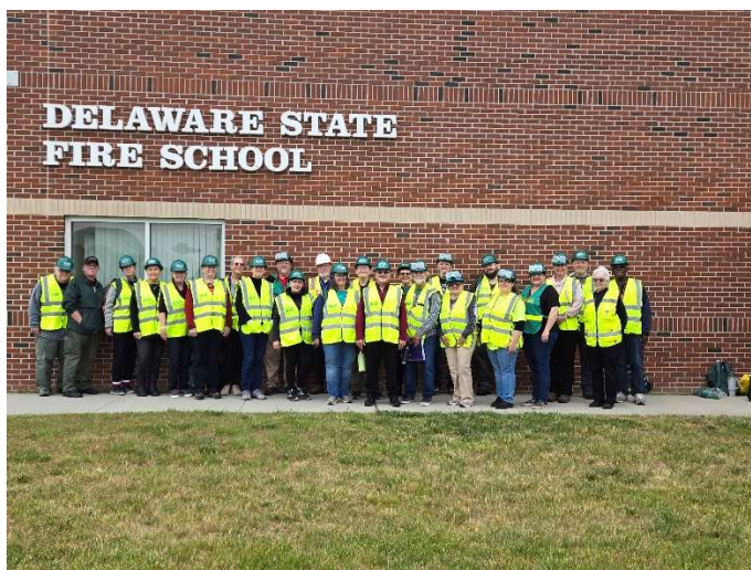
CERT BASIC TRAINING CLASS Spring 2024