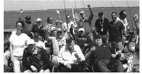
Unit's fishing trip with residents of the Rhode Island Veterans Home.

Unit #118 (RI) - The ladies of Ocean State, Unit 118, have had a busy autumn season. We began our regular monthly meetings again in September after taking a break for the summer.