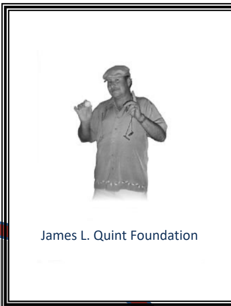
James L. Quint Foundation