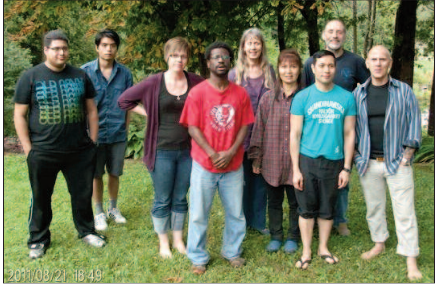
FIRST ANNUAL FIGU-LANDESGRUPPE CANADA MEETING / AUG. 21, 2011