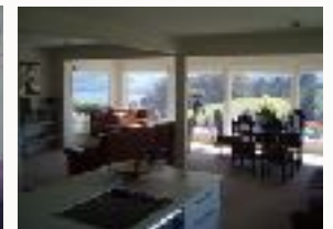
Kitchen & Living room