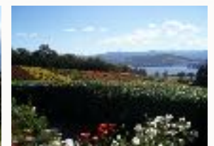
Protea field and rose courtyard