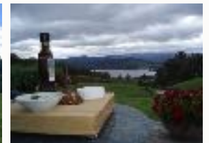
Relax on spacious decks