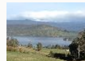
Snow covered Hartz Mountains

Windflowers overlooks the magnificent Huon River to the majestic and often snow covered mountain ranges of the Hartz, Mt Picton and Addison's Peak. Cottage gardens, courtyard, olive grove and protea plantation are yours to enjoy.