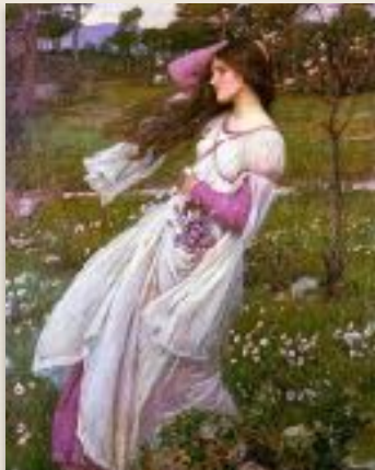
“Windflowers” by JW Waterhouse

Windflowers offers stylish & comfortable accommodation in a tranquil setting amongst olive groves, gardens and fields with spectacular views over the magnificent Huon River to the majestic mountain ranges of Tasmania's South West.