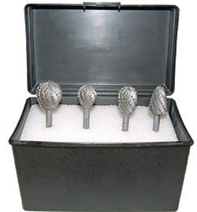
SETS ALSO AVAILABLE