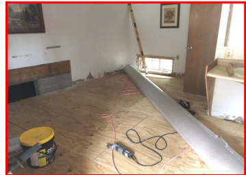
Putting Down New Flooring And Carpet In One Room Of The Swiss Village Family Quarters