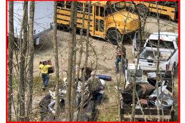
Hauling Off Scrap Metal