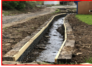
New Drainage Ditch Behind RV Pads And Back Pool Wall