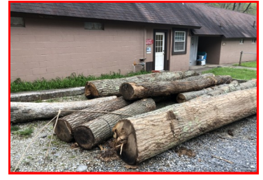
These Cut Logs Will Be Used to Line Camp Roads