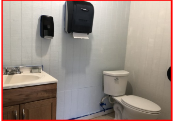
Painted Bathrooms And Installed New Commodes At Dining Hall