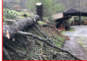
Tree Clean-Up After A Storm