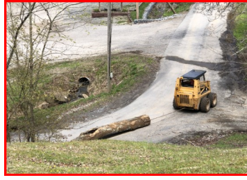
Skidsteer Helping To Pull Fallen Trees