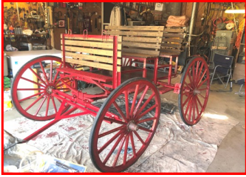
Restored Horse Buggy