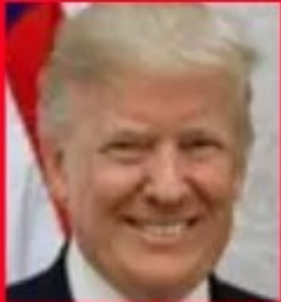
Donald J Trump