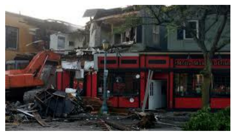
Molly Malone's Pleasant Ridge after the fire

Meanwhile, if you are looking for a jam session please try the Monday evening Jam at Molly Malone's Covington, located at 112 E. 4th Street. This jam runs