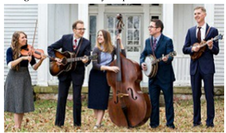
High Fidelity Band

FREE concerts on the outdoor Downtown Romp stage with performances by High Fidelity , Front Country , Town Mountain , and headliner Yonder Mountain String Band . Also 1<sup>st</sup> day for public tours of Museum.