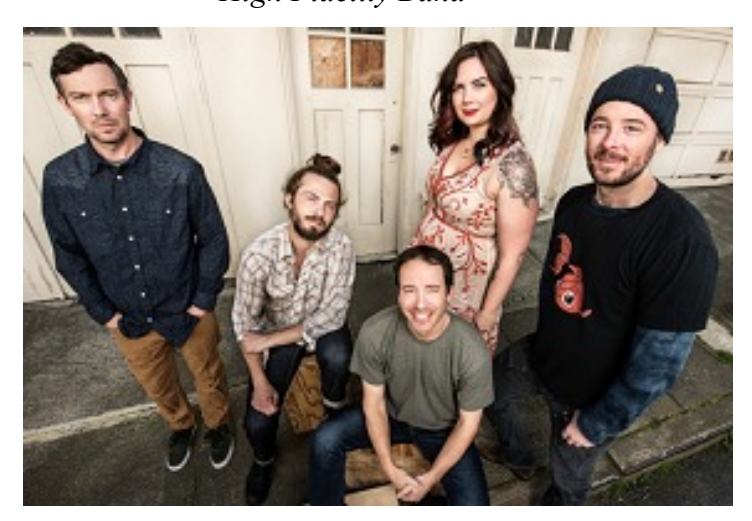
Headliner - Yonder Mountain String Band

Interested in a show and tour of the new Bluegrass Museum and Hall of Fame?? NKBMA is putting together a bus trip to Owensboro, KY for next March. A long, all day trip and tour returning late the same day. Prices will depend upon number of interested parties. If you are interested please see Ron Simmons who is the trip coordinator