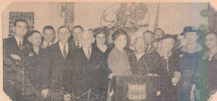
A part of the ministers who attended the convention at the Union Rescue Mission at Pontiac, Michigan.