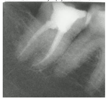
Fig 4:Four canals