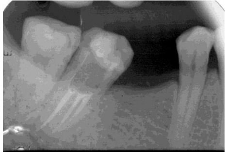
Fig 3:Three canals