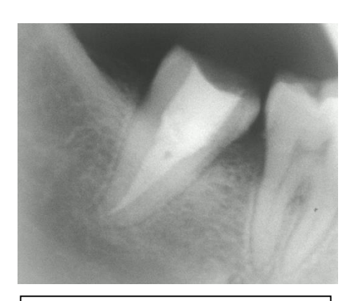
Fig 1:Single canal

Case 3, Case 4: THREE CANALS and FOUR CANALS Of all the above mentioned variations; Mandibular 2nd molar with 3 canals and 4 canals has got the maximum share (Fig.1c & Fig.1d). After the access cavity preparation and determination of correct working length, cleaning and shaping was done with the help of Rotary ProTaper files, followed by obturation with corresponding gutta purcha cones (Fig.3 and 4)