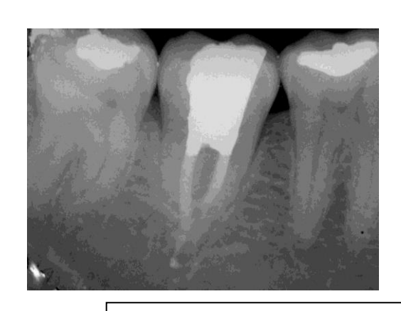
Fig 2:Two canals