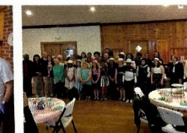
The Diamond Girls hosted a tea for us.