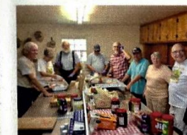
A first-class sandwich-assembly team!

'Joe's Place' is our community food bank, where we provide groceries and seasonal items to our neighbors twice a month. Our Daughters of the King chapter provides food for children at the elementary school, and we all pitch in for special events like holidays, hosting lunch for the local 100-mile bike ride, and other community events.