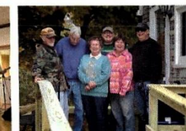
We enjoy helping each other with projects.