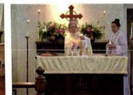
We celebrate Holy Eucharist on Sunday mornings.