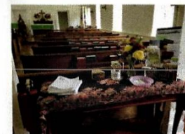
Our church building dates from the 18th century.

When we gather as the Body of Christ on Sunday mornings, we worship God with joy. We sing, read scripture, and celebrate Holy Eucharist, using the rites of the Episcopal Church. You are welcome to join us!