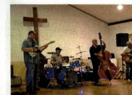
We love all kinds of music.

Our parish community comes together over good food, good music, and mutual service. We gather in small groups for study and fellowship, put on a big annual dinner (a tradition since 1878!), have occasional concerts and movie nights, and share plenty of laughter and tears.