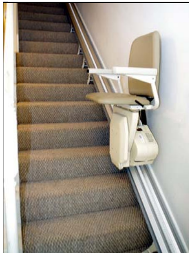
chair lift electric chair lift on stairs