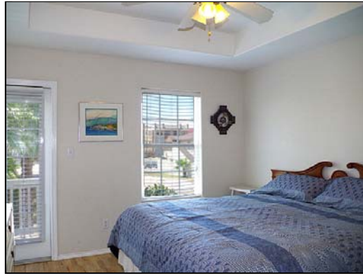
master bedroom spacious master suite