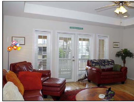
living light and bright