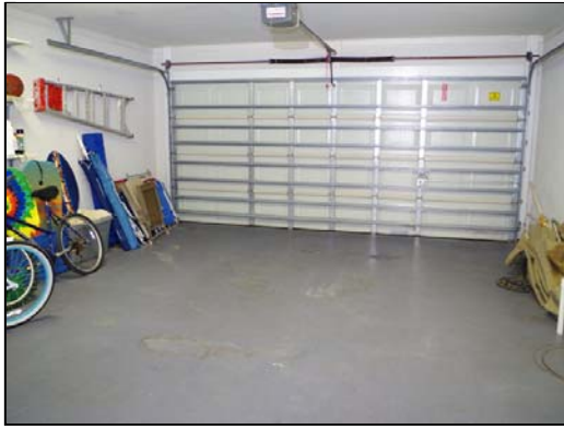
garage 2-car garage