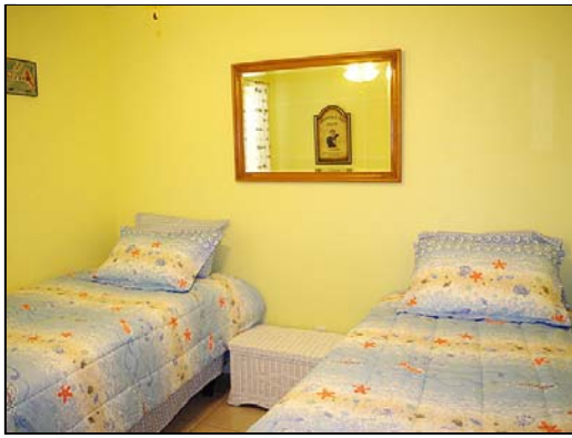
guest bedroom #2 guest bedroom on 1st floor