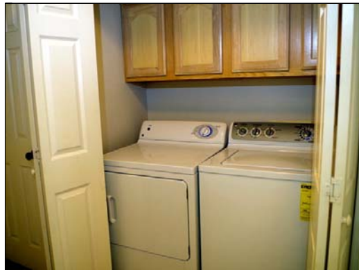
utility full size washer/dryer on 1st floor