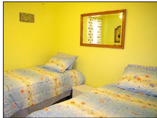
guest bedroom #2 twin beds