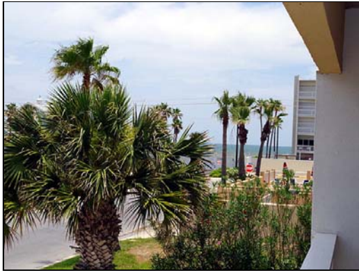
front balcony partial ocean view