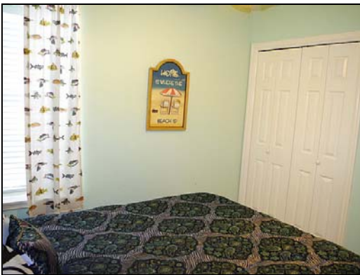
guest bedroom #1 large closet