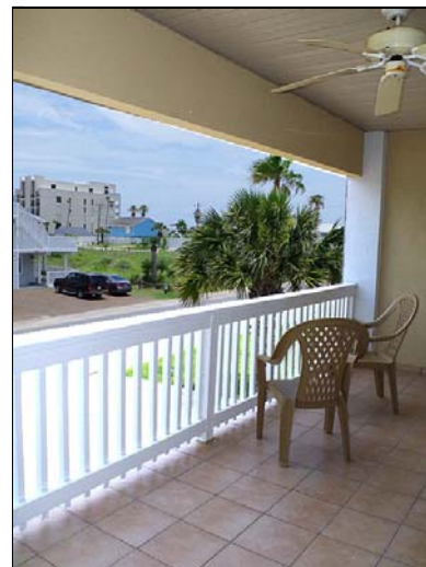
front balcony partial ocean view