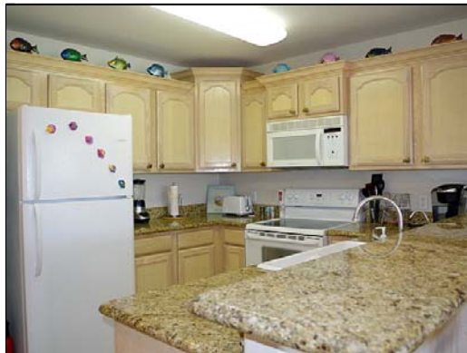
kitchen all appliances convey with sale