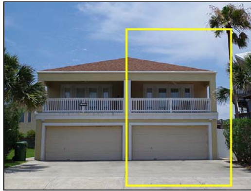
exterior unit b - west side of building