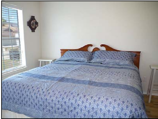
master bedroom king bed