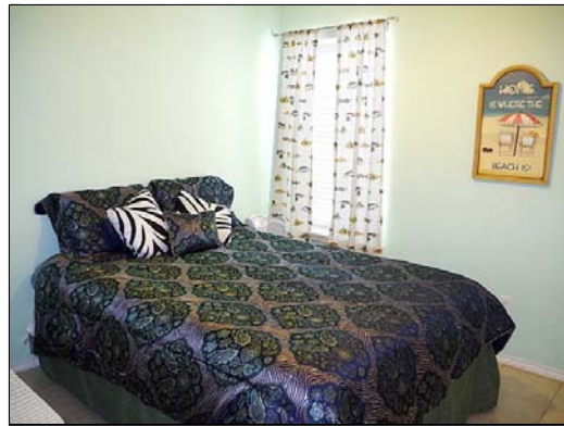
guest bedroom #1 queen bed guest bedroom