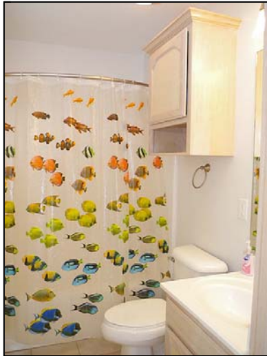
guest bath guest bedrooms share 1st floor full bath with tub/shower combo