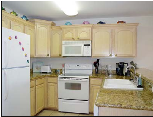
kitchen plenty of cabinet space