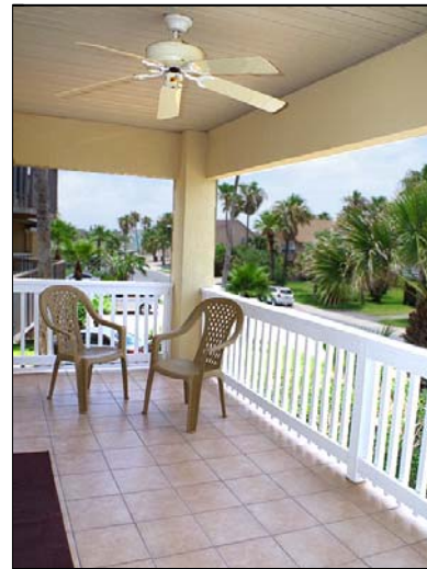
front balcony front balcony