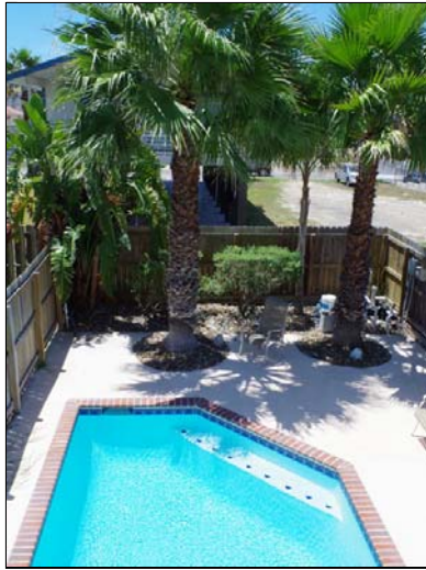
pool shady poolside palms