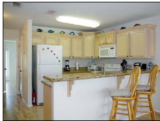
kitchen additional seating