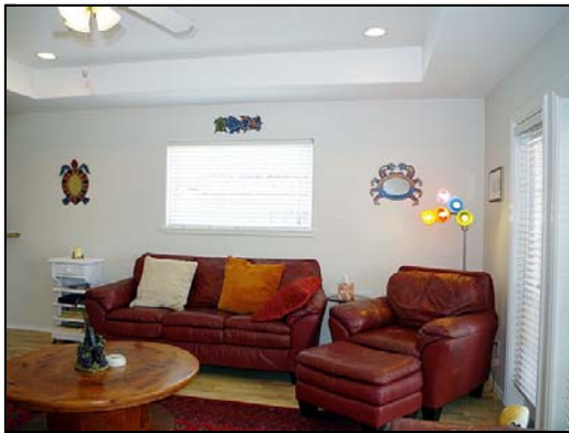
living selling furnished