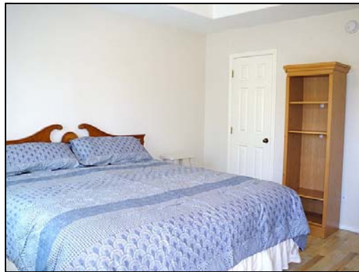
master bedroom walk in closet