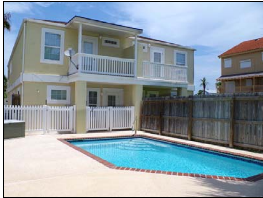
pool covered balcony overlooks pool