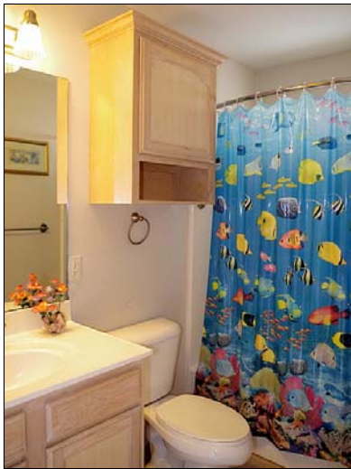
master bath ensuite full bath with tub/shower combo