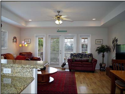
living open concept