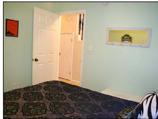
guest bedroom #1