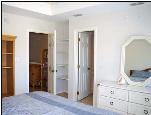
master bedroom built in shelves