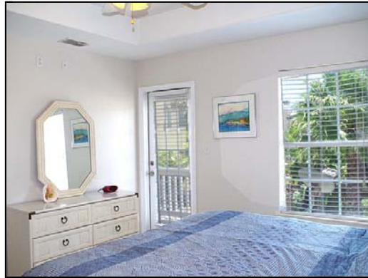
master bedroom master has access to balcony overlooking pool