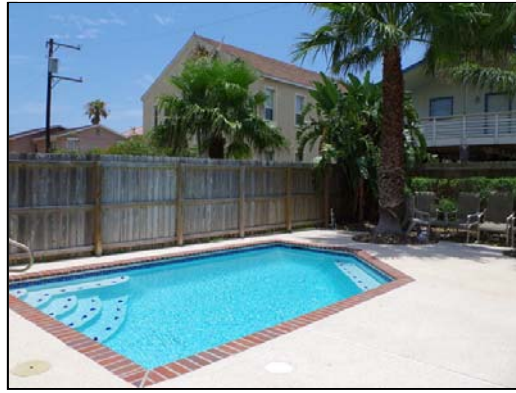
pool private pool