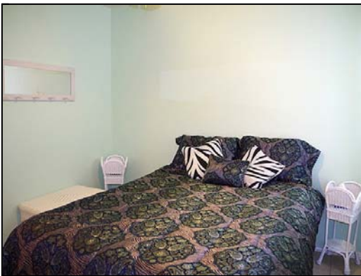
guest bedroom #1 guest bedroom on 1st floor