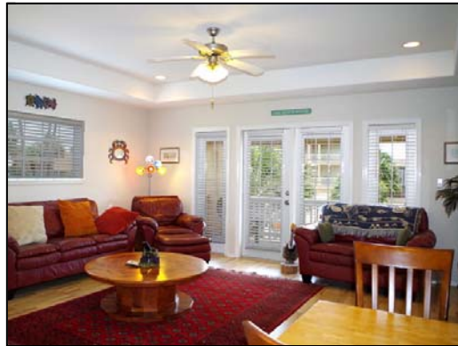
living access to front balcony from living area