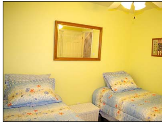
guest bedroom #2