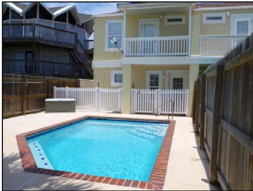
pool pool on south side of home