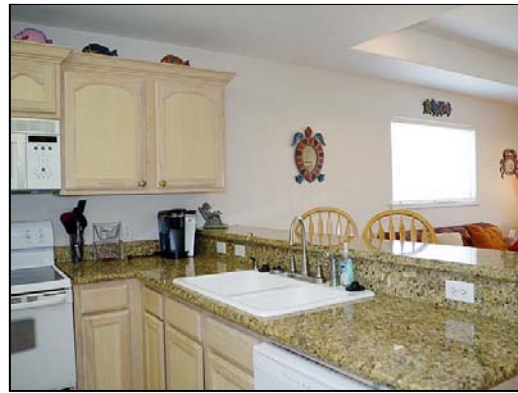
kitchen granite counters