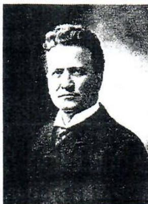
Robert La Follette

As changes were going on at the federal level, Progressives were making their presence known within state and local politics, as well. One of the most famous figures known for reforming state government was Robert La Follette (1855 – 1925). Known as “Fighting Bob,” La Follette was governor of Wisconsin from 1901 to 1906 and gained national attention as a reformer. In 1903, his state adopted the direct primary . This meant that the people would choose the candidates for public office, rather than having them be selected by party bosses. Within ten years of La Follette’s reform, almost every state had a similar law. Referred to by many as the “Wisconsin idea,” La Follette’s program included a merit system for state civil service and instituted state regulations and taxes on railroads. Because of men like La Follette, states began adopting reforms such as the referendum (allowing citizens to vote directly on government proposals), the initiative (allowing for citizens of the state to force a vote on a particular issue), the recall (holding special elections to remove corrupt officials from office before their term has expired), and the secret (Australian) ballot (allowing individuals to vote secretly, thereby removing the fear of reprisal if they vote against certain candidates).