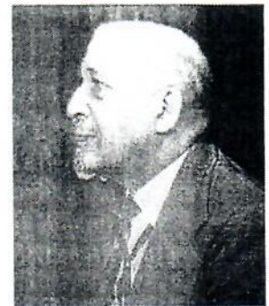
W.E.B. Du Bois

W.E.B. Du Bois (1868 – 1963): Another African American leader of the day was W.E.B. Du Bois. Du Bois was the first black Ph.D. graduate from Harvard University and adamantly disagreed with Booker T. Washington. He was offended by the ideas expressed in Washington's Atlanta speech and viewed Washington as someone who had sold out to try and please the white community. For this reason, he labeled the speech the Atlanta Compromise . Instead of accepting segregation and "settling" for achieving in blue collar fields, Du Bois argued that blacks should pursue occupations in the humanities and in white collar (managerial or professional) fields. Du Bois, unlike Washington, believed that blacks must be politically, legally, and socially active in order to obtain true equality. Du Bois helped to organize a group of black intellectuals known as the Niagara Movement . Their goal was to outline an agenda for African American progress in the United States. In 1905, these leaders met on the Canadian side of Niagara Falls after being denied hotel accommodations in the US. In 1909, Du Bois was instrumental in founding the National Association for the Advancement of Colored People (NAACP) . The organization devoted itself to the progress of the African American community. It also founded an official magazine