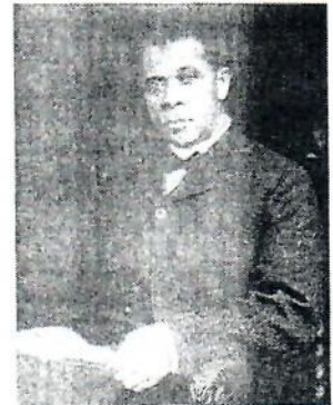
Booker T. Washington

Booker T. Washington (1856 – 1915): During this period in US history, there were a number of notable African Americans who emerged. One of these was a former slave named Booker T. Washington. Washington founded the Tuskegee Institute in Alabama. Tuskegee served to train African Americans in a trade so that they could achieve economic freedom and escape the oppression often suffered by uneducated blacks. Washington taught his students that if blacks excelled in teaching, agriculture, and blue collar fields (trades requiring manual labor), they would eventually be treated as equal citizens. His school became an important center for technical education in the South.