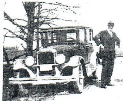
Ford's Model T

Although he was not the first to invent the automobile, Henry Ford (1863 – 1947) was the first to perfect and successfully market it. In 1907, Ford sold 30,000 of his first, mass-produced car — the Model T . What truly set Ford apart was his vision for mass production. He decided to produce enough automobiles that he could afford to sell them at greatly reduced prices. He wanted “ordinary people” to be able to afford his cars.