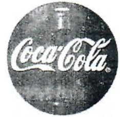
The Coca-Cola Logo

Meanwhile, certain companies contributed to the transformation as well. Kodak™ introduced cameras that could be owned and operated by average consumers. For the first time, people other than professional photographers could regularly take photos of individuals and events. Initially introduced as a medicine (it originally contained cocaine), Coca Cola™ became well known, introducing the concept of a bottled soft drink to the US public as it launched one of the country's first nationwide advertising campaigns. Such innovative practices also helped develop the new mass culture of the United States.