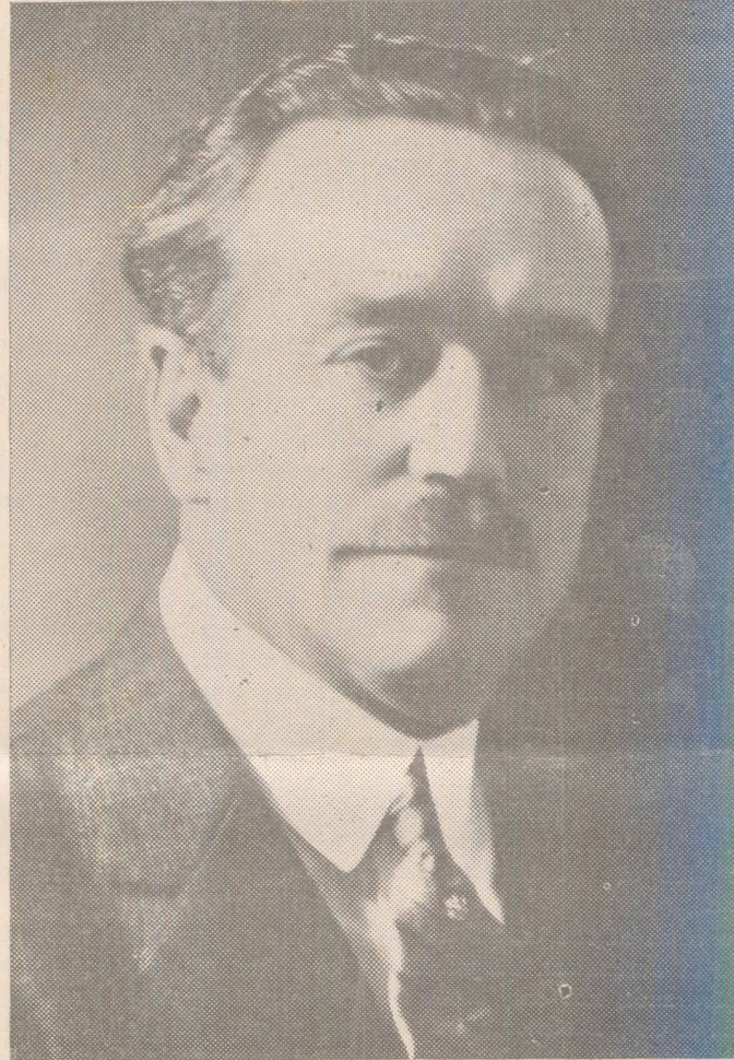
LATE CHARLES F. PARHAM

The founder of the Original Apostolic Faith Movement, the late Charles F. Parham's birthday was June 4. During his lifetime many birthday meetings were held. Since his death many of his friends have kept the Sunday nearest June 4 as a memorial to him. Many of our readers will remember the birthday meetings as there were many converted under his ministry.