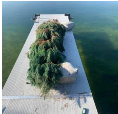
Anchored Christmas tree to be placed under pier