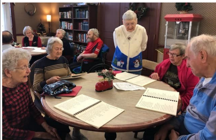
Seniors on Center's, Senior Center Singers Performing at Bennington Glen December 3rd

It's that time of the year again to renew your membership. Starting January 1, 2020 Seniors on Center membership will be going up to $20.00 for the year. So stop on in and sign up.