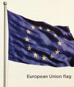
European Union flag

Do values line up with political attitudes? For the most part, they do. A survey of 20 European countries, ranging from historically liberal to historically conservative states, found that left-leaning citizens in all countries were more likely to value benevolence and universalism, while right-leaning citizens across the board typically valued conformity and tradition. In liberal countries, values explained political stance even more strongly than socioeconomic status did. The only place where values had little correlation with political outlook was in postcommunist countries such as the Czech Republic and Poland, where labels such as "left" and "right" seem to have little meaning.