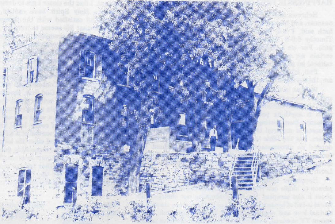
The Parham home located at 7th and East Avenue in Baxter Springs, Kansas was purchased about 1910 or 11 and vacated by the family in the mid 40's. It is torn down now and the city is building a new Historical Museum and park there.