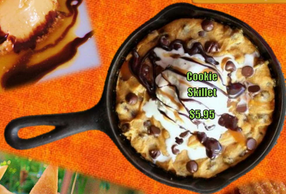
Cookie Skillet $5.95