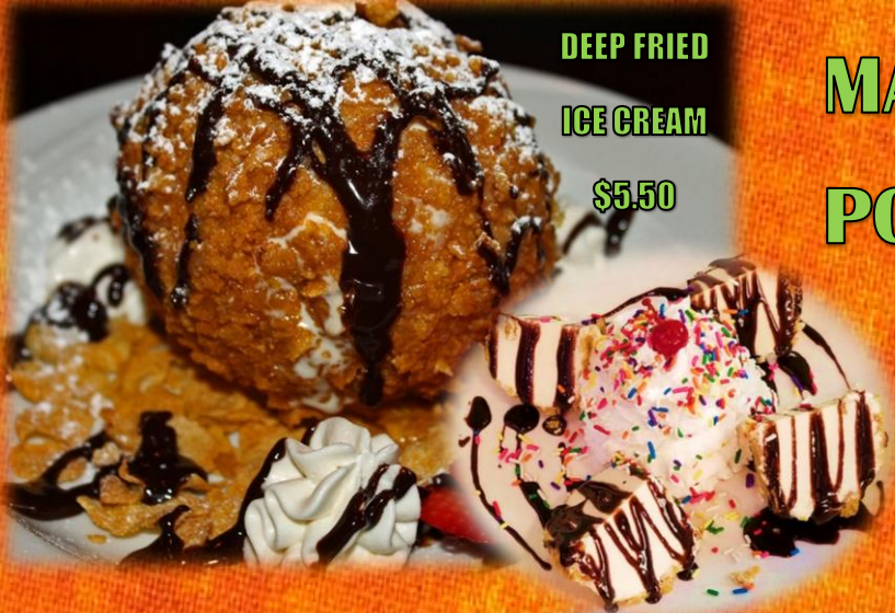
DEEP FRIED ICE CREAM $5.50