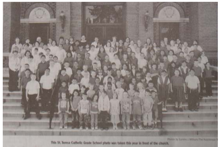
This St. Teresa Catholic Grade School photo was taken this year in front of the church.