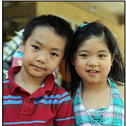
Auxiliary News and Views

If you, your local or your state have already donated, we thank you so much. To those of you who have not yet done so we do hope we can count on your support. To insure recognition at the National Convention, please have donations sent in no later than July 15th. Regular donations will continue at the National Convention and all donations will be recognized in either the September or the October issue of the News & Views.