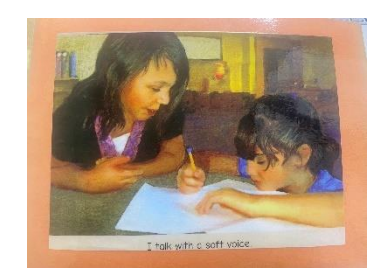
Grace and Courtesy

During circle time we learn about Grace and Courtesy . These lessons are given daily. Grace and Courtesy lessons are an essential part of our environment as they teach the children what it means to be polite and how to appropriately communicate one's feelings.