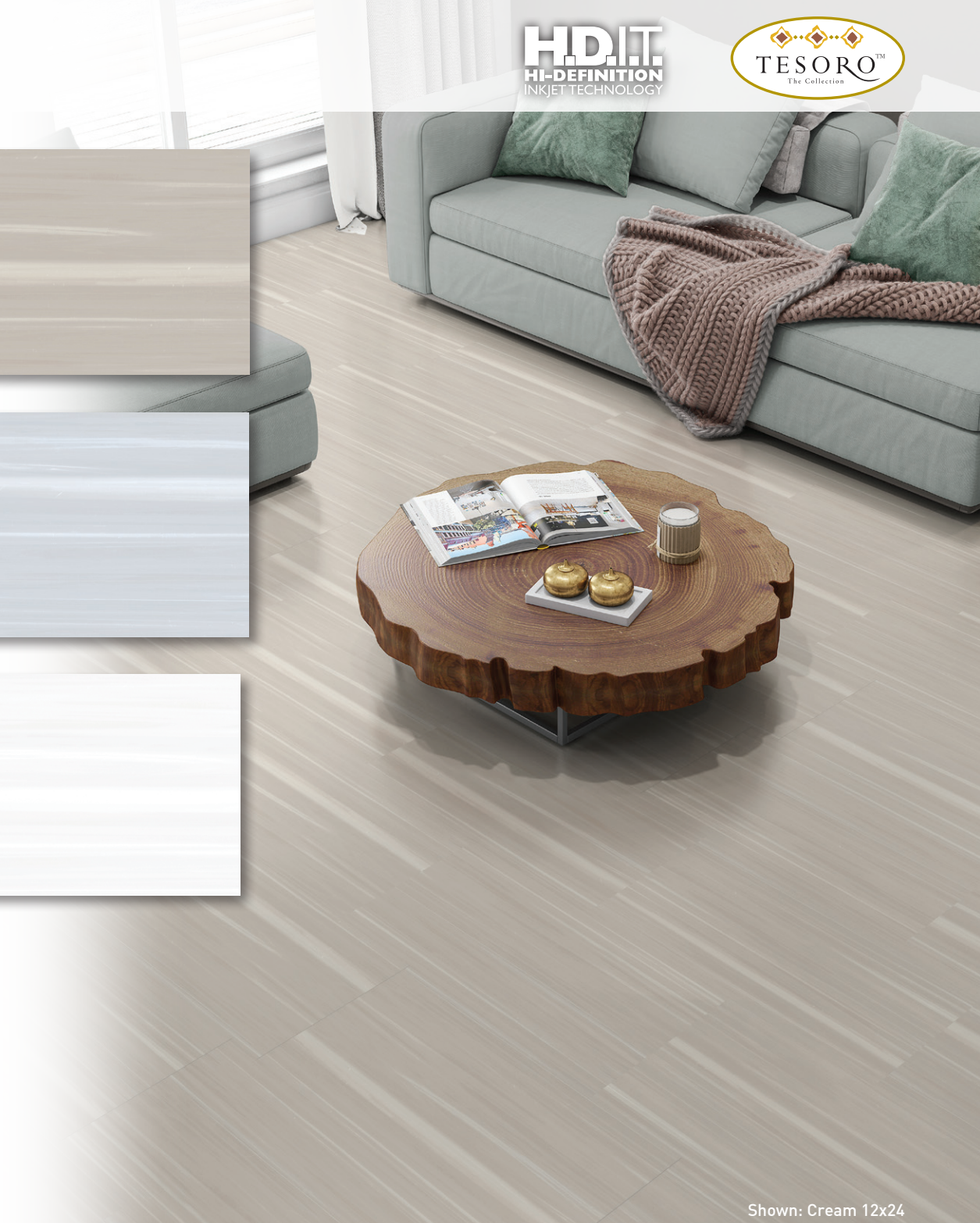
Shown: Cream 12x24