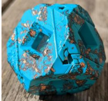
Turquoise Version with White Opal Gem