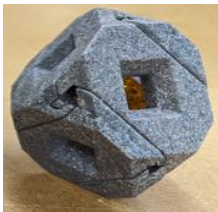
Common Granite Version with Amber Gem

If desiring to combine one of these with another puzzle listed for sale, feel free to contact me directly at the same above email address, so that a Paypal invoice can be prepared.